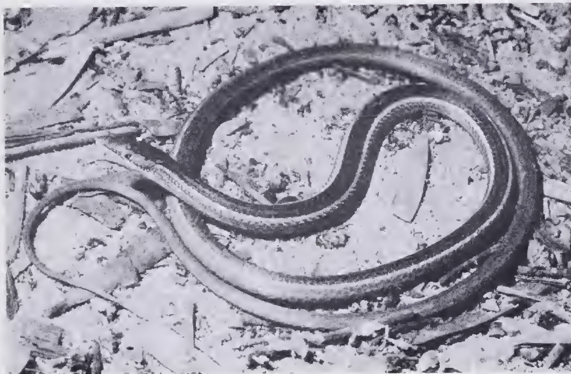
Figure 5 Holotype of Aclysa concinna major , photographed in life by G. Harold.

stripe pale brownish grey. Lateral scales brownish grey, edged brownish white. Chin and throat white. Breast and abdomen white, each scale with a dark greyish brown or blackish brown triangular spot. Subcaudals greyish brown, edged greyish white.